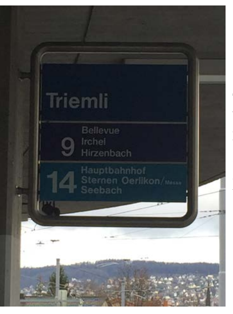
Tuesday morning we arose early, ate and walked a few blocks to the closest Tram station and took the #14 to Triemli Hospital

We arrived in Zurich at 7:55 am on Monday the 11<sup>th</sup>. JT rested up and prepared himself mentally for the procedure.