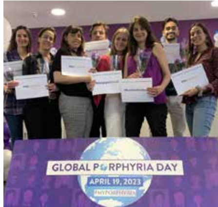
Alnylam Pharmaceuticals celebrated Global Porphyria Day.

This year's Global Porphyria Day was April 19, and groups around the world observed the date. The Brazil Porphyria Foundation hosted a series of activities and educational projects. The Canadian Porphyria Association lit the capitol with purple, and Alnylam Pharmaceuticals threw a party.