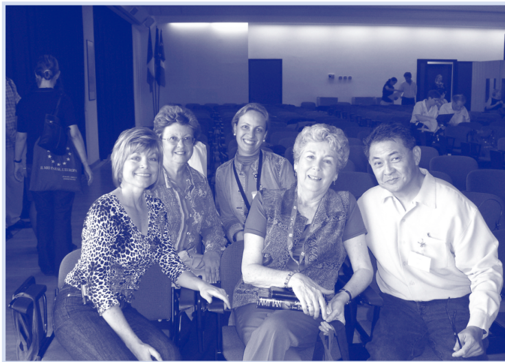
— APR MEMBERS —